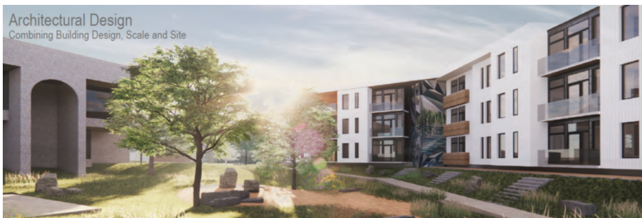
Rendering of the 3300 Penrose Place development, with the original GSA building on the left and new affordable apartment homes on the right.

Boulder Housing Partners has purchased a 4.35-acre site at 3300 Penrose Place for redevelopment into a new 115-unit affordable apartment community. The site, adjacent to Foothills Highway and 34th Street, was previously owned by the Geological Society of America (GSA). It includes an architecturally notable building which will be incorporated into the new community development. Learn more: bit.ly/BHP-GSA-115Homes